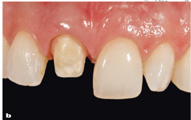
Fig 3 (a) HT zirconia is interesting not only for its mechanical qualities but also for the highly esthetic result, achieved thanks to its improved optical properties, especially when the natural abutment is of a normal shade. (b) Tooth preparation of tooth 11: the tooth is nonvital. (c) For this restoration, an HT zirconia veneered with feldspathic ceramic was used. Thanks to the normal color of the abutment and the high translucency of the material, the space required for the crown was less than if an opaque zirconia had been used. The restorations have been stained slightly superficially. (Clinical work by Dr. Fabio Currarino.)