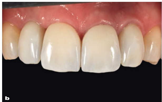
Fig 4 (a) Multilayered, HT zirconia offers the possibility of using the cut-back design technique to reduce the layer of the veneer on the vestibular area and to maintain the monolithic palatal area only, polished with diamond paste. (b) A clinical case of two ML zirconia crowns on natural abutments for the central incisors, and two screw-retained crowns on implants in position 22 and 12. All the restorations had a cut-back design and were layered with feldspathic ceramic only on the buccal surface. Palatally, the zirconia is monolithic. (Clinical work by Dr. Marco Perata.)

Recently, a multilayered (ML) technology was introduced for zirconia – an alternative to the process of the infiltration