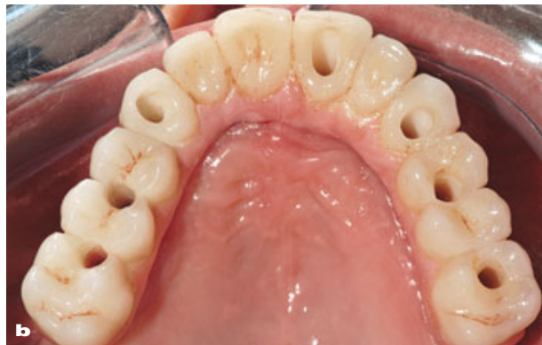
Fig 2 (a) Due to the good mechanical properties of tetragonal zirconia, this material is an option for manufacturing implant-supported frameworks veneered with feldspathic ceramic. Pictured here is an example of a screw-retained Toronto Bridge. (b) The same screw-retained superstructure as in Fig 2a, completed with white and pink feldspathic ceramic. (Clinical work by Dr. Roberto Martinengo.)

to c). High-translucency (HT) zirconia is interesting because, thanks to its superior mechanical properties, it allows the fabrication of highly esthetic extended