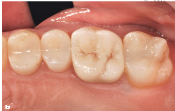
Fig 5 (a) Multilayered, high-translucency (HT) zirconia is also interesting for monolithic solutions. The multilayered composition offers a different chromaticity; it is therefore possible to solve esthetic challenges without using the infiltration technique and without layering it with a veneer. (b) A multilayered zirconia monolithic crown for the natural abutment of tooth 26. Stain was applied only in the fissures, while the external surface was glazed and the occlusal area highly polished. (Clinical work by Dr. Marco Perata.)

ferent layers of translucency and color have the opportunity to produce more esthetic multicolor dentin and enamel. Furthermore, the multilayered option allows for the cut-back technique, which combines the functional part with the monolithic part without limiting esthetics (Figs 4a and b).