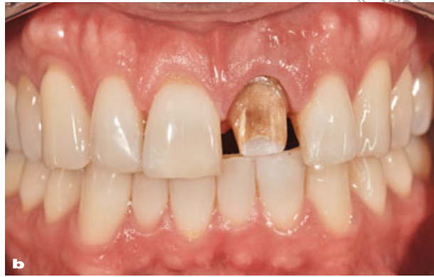
Fig 1 (a) Opaque zirconia is an ideal choice to mask dark discolorations from whatever origin. (b and c) A clinical case where the dark effect of the discolored natural abutment on tooth 21 has been screened with opaque zirconia layered with a sufficient thickness of feldspathic ceramic to produce a mimetic effect. (Clinical work by Dr. Fabio Currarino.)